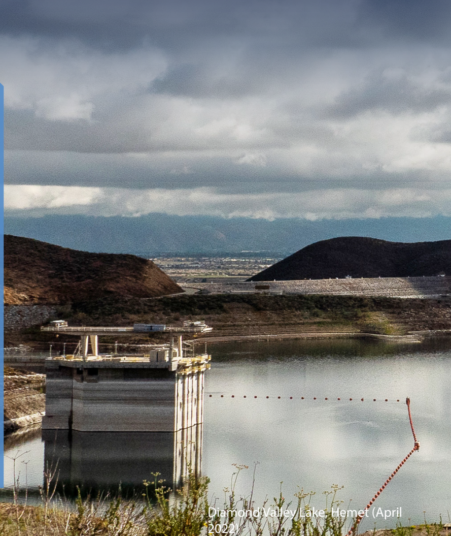
Diamond Valley Lake, Hemet (April 2022)

METROPOLITAN INVITES YOU TO PARTICIPATE VIA ZOOM