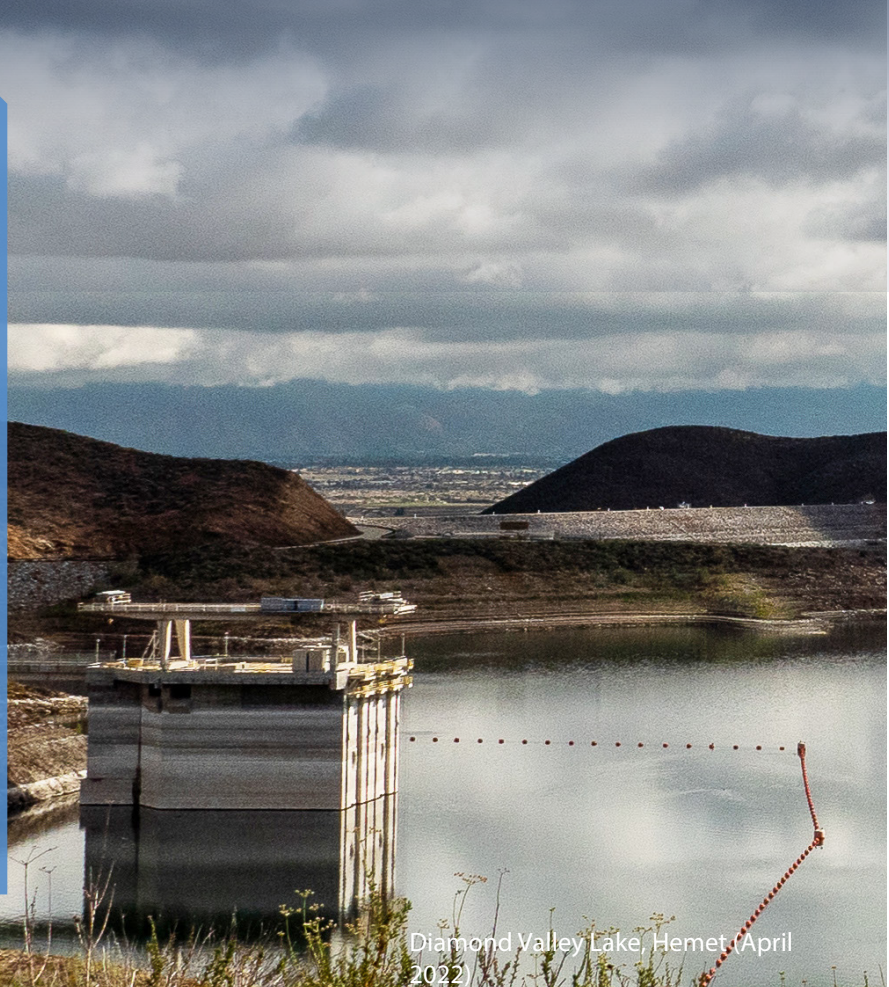
Diamond Valley Lake, Hemet (April 2022)

METROPOLITAN INVITES YOU TO PARTICIPATE VIA ZOOM